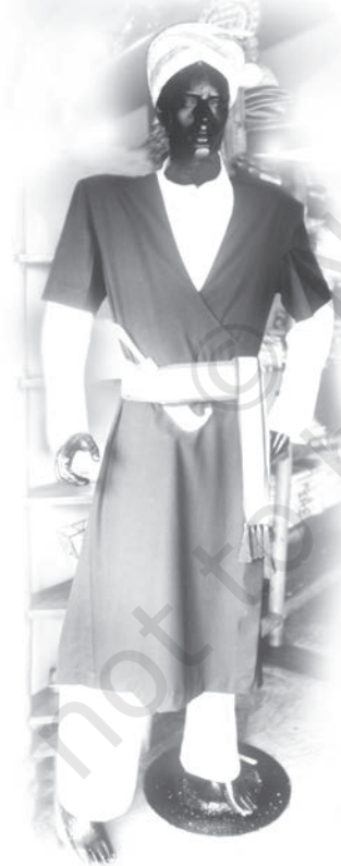
Traditional Coorgi dress

mainstream a tradition which most people follow